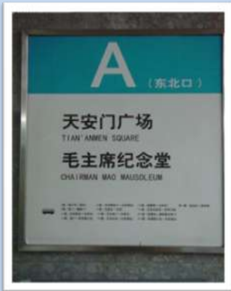
Exits are marked with places of interest