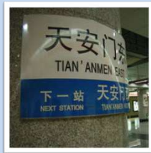
The current station and the next are clearly labeled in English & Chinese